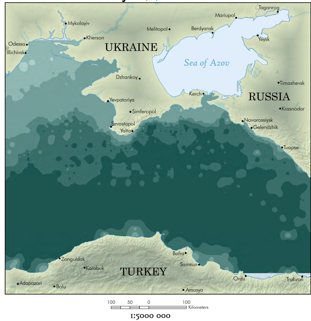
Mean Salinity 1991