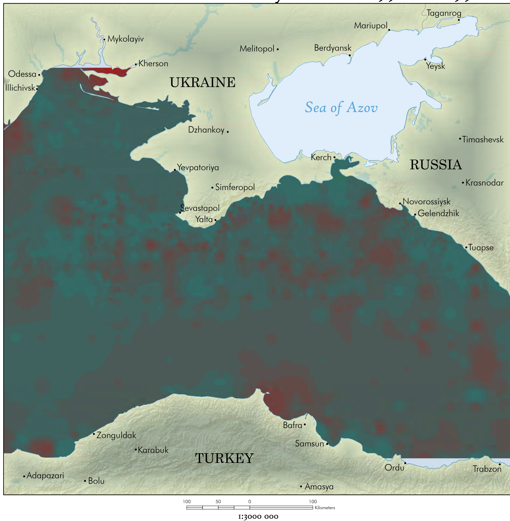
Mean Difference in Salinity between 1991 and 1992